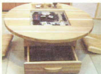
Low table with stove