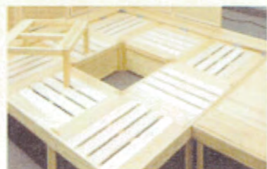
The frame of under floor